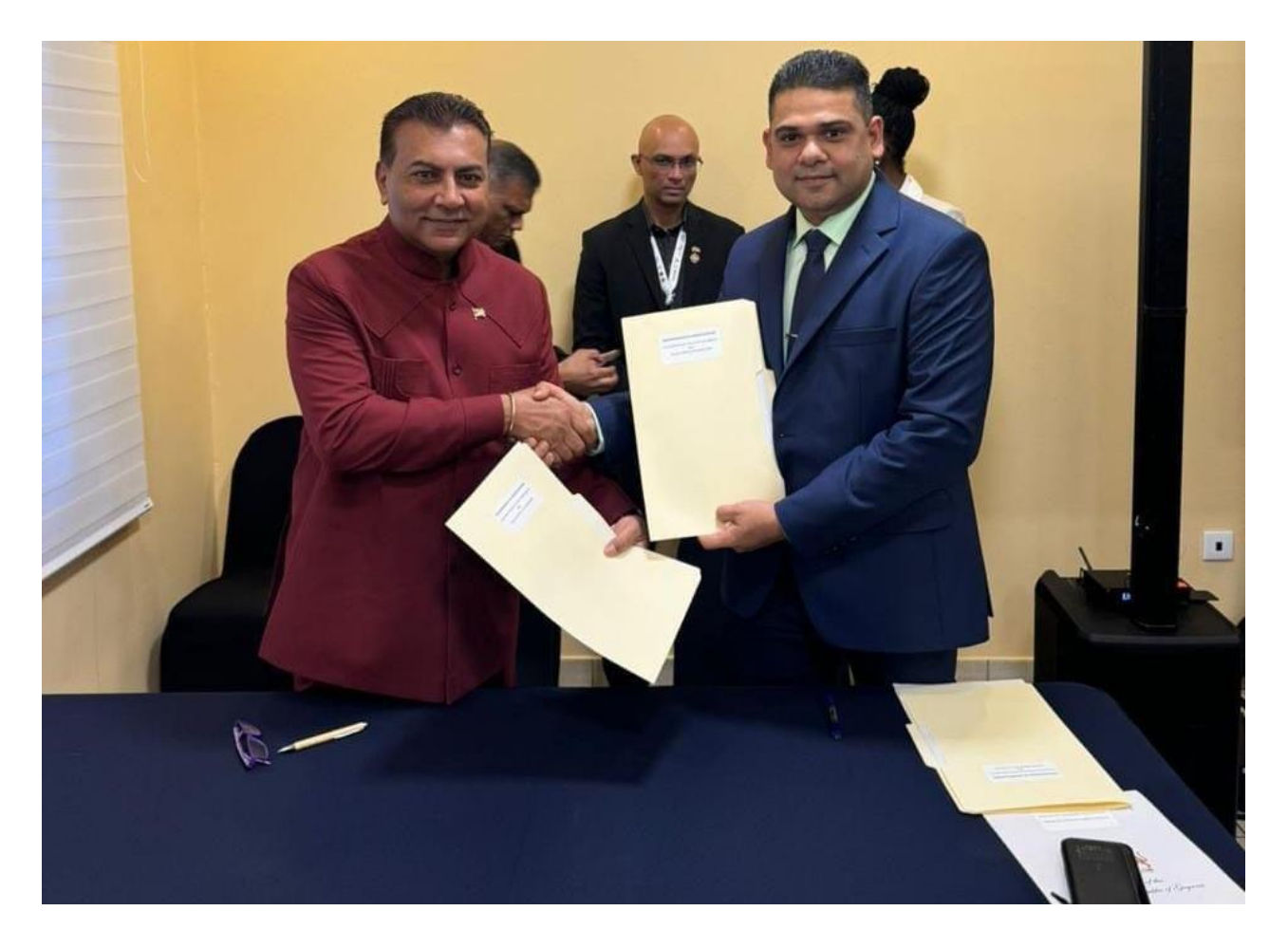
MOU Signing Between Guyana Office for Investment and Suriname Investment & Trade Agency