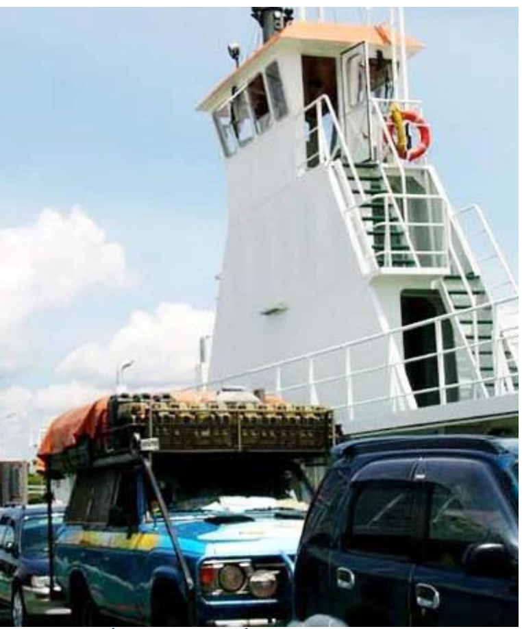
Canawaima Ferry Service INC.

The project will operate under a Public Private Partnership (PPP) using the Design-Build-Finance-Operate-Maintain model (DBFOM)